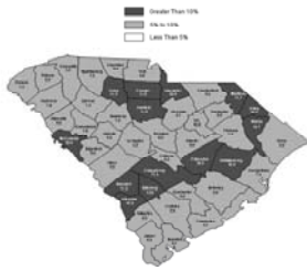
Unemployment Rates July 2007- July 2008

Unemployment in the Worklink WIA increased from 6.4% in June to 6.9% in July. Oconee County reported the highest rate at 7.7%, while Pickens County had the lowest rate at 6.3%. The state's unemployment rate increased from 6.1% in June to 7.0% in July.